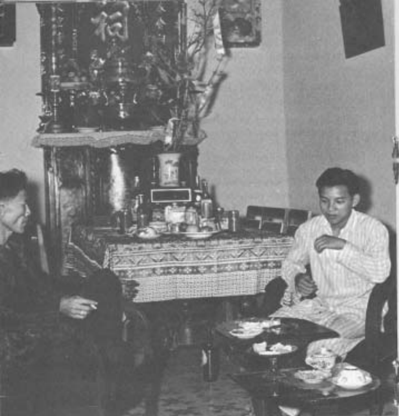
Tet Nguyen Dan (New Year) is observed quietly by some.