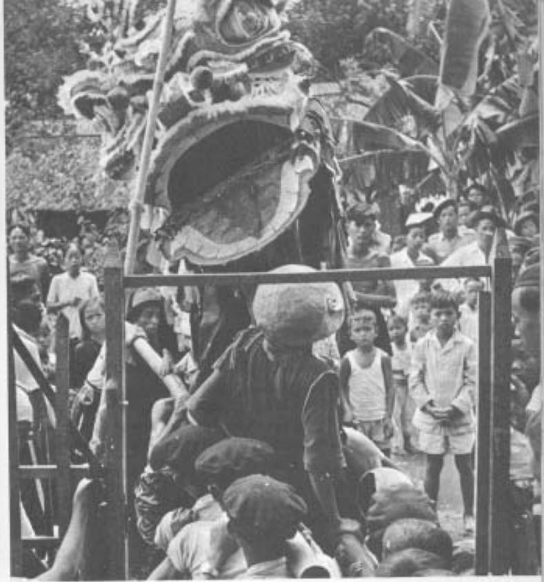
Tet Nguyen Dan is celebrated boisterously by others.